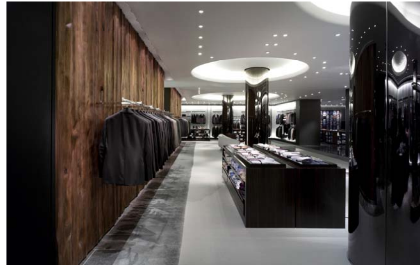
Photo of ARIDO Award Winning Project W. Hotel by Burdi Filek